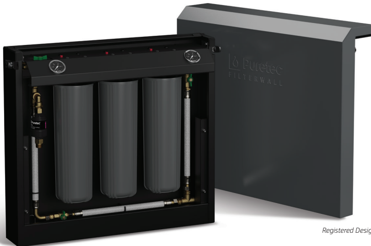
3-Stage Filtration System with bypass and PVM