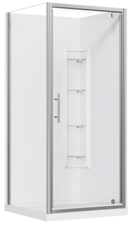
*Protected and Licensed under Patent No.529079