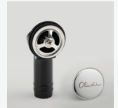
Overflow Round with Cover