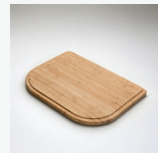
AC15 Bamboo Board