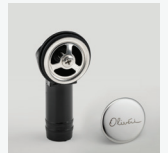
Overflow Round with Cover