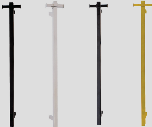
BLACK PSV1000 BLACK

(Polished Stainless/Black/Brushed Stainless/Brushed Gunmetal/Brushed Brass)