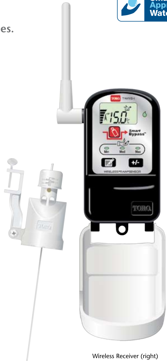
Wireless Receiver (right) Wireless Transmitter (left)