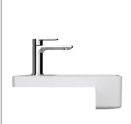
Tapware shown not included.

The Urbane II basin range features refined thin edge details, contemporary rectangular forms, and a practical, easy-to-clean bowl. Designed to enhance the complete Urbane II bathroom collection, the basin range is available in a range of configurations, ideal for general purpose, domestic and commercial applications.