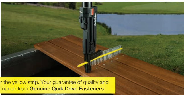
Look for the yellow strip. Your guarantee of quality and performance from Genuine Quik Drive Fasteners.