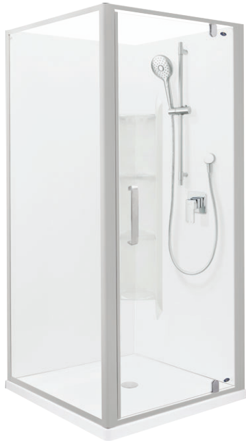
Note: Tapware and accessories illustrated in photography are not included

The Ruby II Square Corner Shower is available in a range of sizes and wall options, with a choice of satin or white frame finishes. The enclosure features a fully reversible door with 6mm toughened safety glass, protected by Englefield CleanLess® glass treatment. The Quick-Fit low profile tray features an ultra high 40mm upstand to enhance watertightness for long lasting performance.