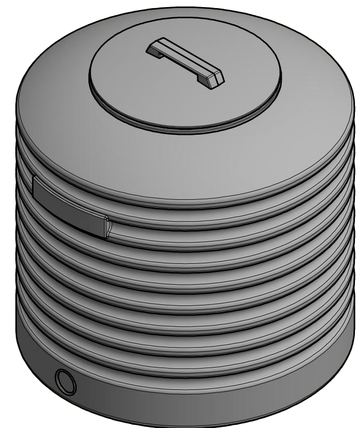
PERSPECTIVE Esc.: 1:10