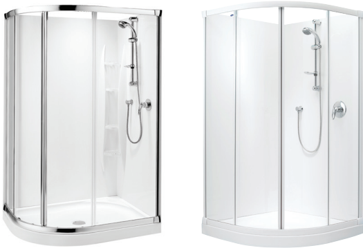
Note: Tapware & accessories as illustrated not included.

The Sapphire Round Corner Sliding shower features double sliding doors with 6mm toughened safety glass. The Quick-Fit tray® features the ultra high 40mm up-stand to enhance watertightness for a drier and safer installation.