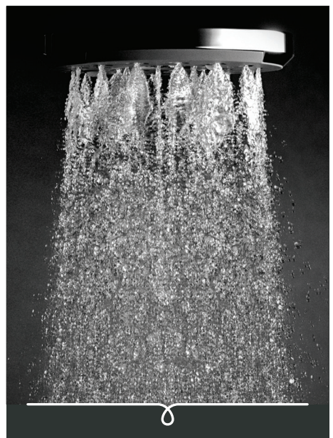
Satinjet®. The unmistakable feeling of 300,000 droplets per second.

Unlike conventional showers, Satinjet uses unique twin-jet technology to create optimum water droplet size and pressure, with over 300,000 droplets per second providing greater warmth and coverage. The result is an immersive, full-body experience.