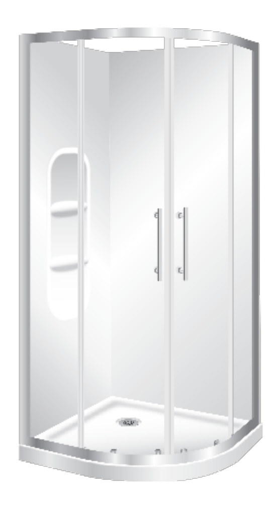
Pictured above - Curvato 900 x 900mm Silva Moulded Wall SKU 3614446