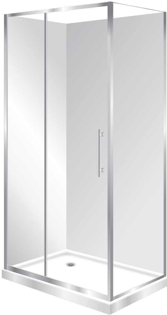
Pictured - Aquero 12x9 LH Flat Wall SILVA SKU