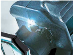
LED job light with pre-glow function