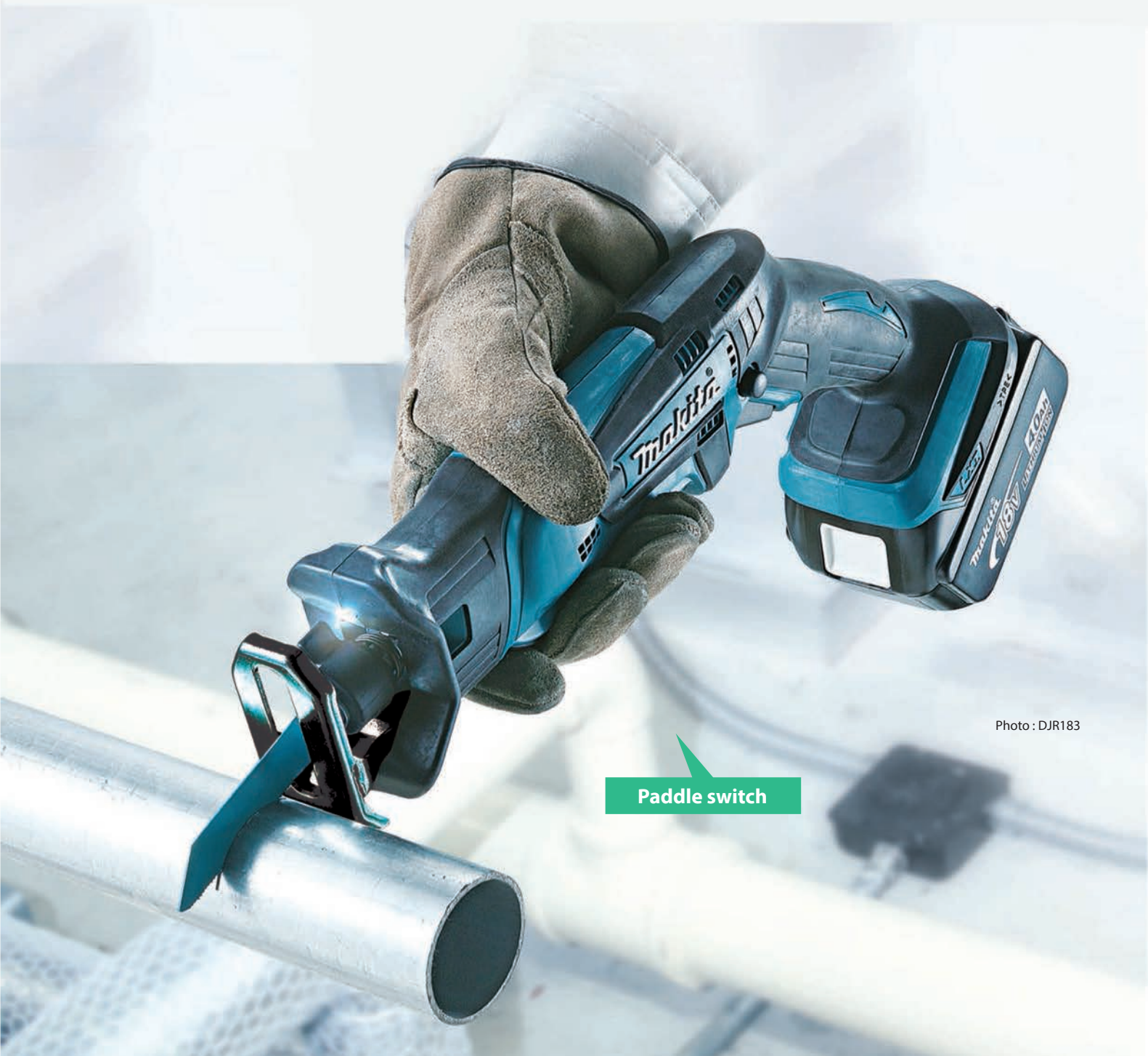
Photo : DJR183

enables various grip position for versatile operations.