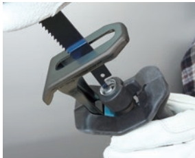
DJR183 Toolless blade clamp for Recipro saw blade

Shoe is adjustable by loosening/fastening a screw for comfortable operation.