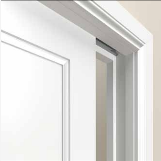
Flat jambs ready for architraves to be fitted over the top