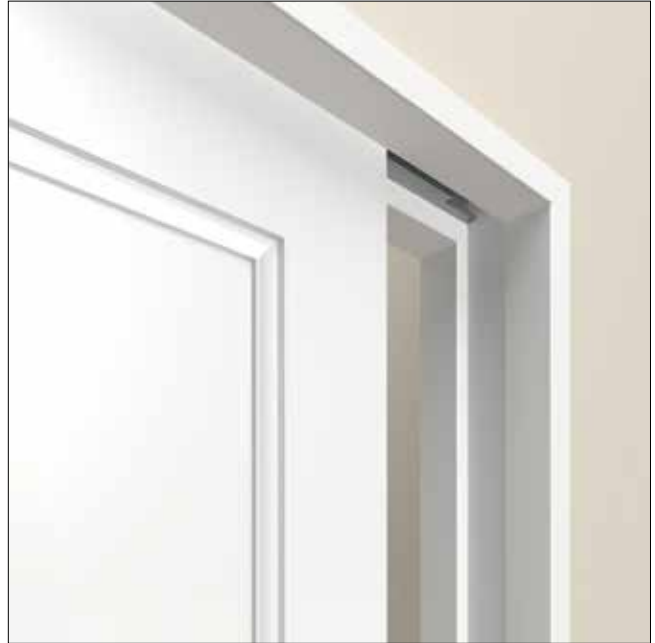
Jambs with a rebate for the wall linings