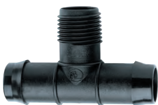
Threaded Tee Male