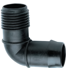
Threaded Elbow Male