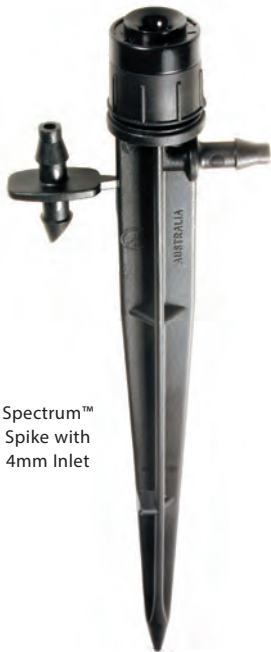
Spectrum™ Spike with 4mm Inlet