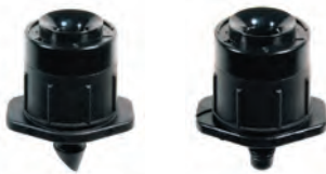
Spectrum™ Barb 4 mm