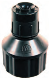
Spectrum™ Thread 1/2" FNPT