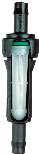
In-Line Filter screen detail